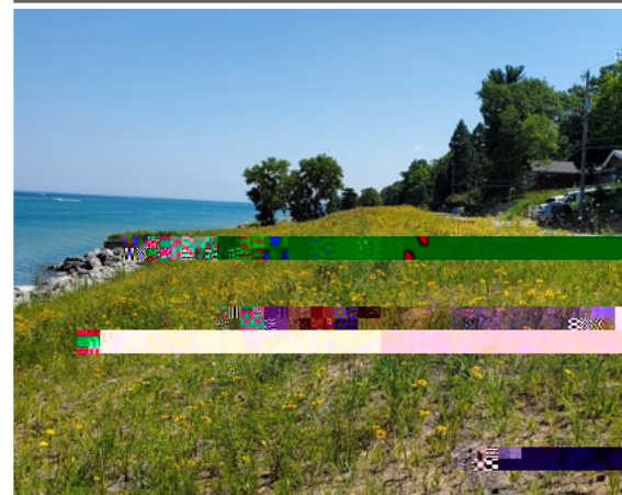
Great Lakes Dune Mix, 1 year after installation

For current pricing, availability, and information on our full installation and management services, visit stantecnativeplantnursery.com