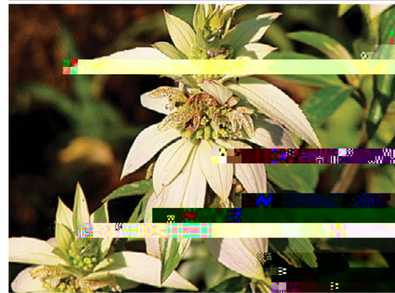
Monarda punctata , Horse Mint